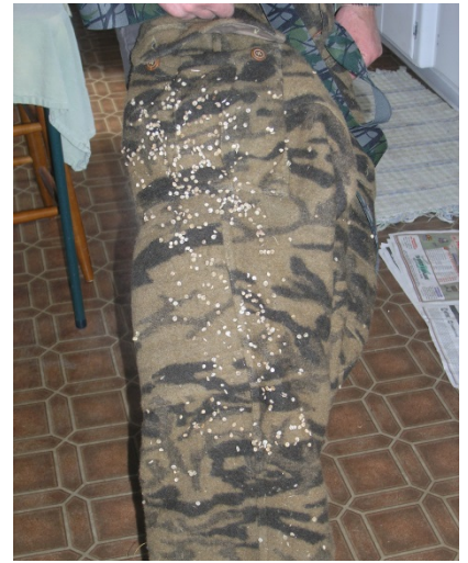
Houndstongue seed on hunting pants.

A series of studies conducted at Montana State University measured the number of seeds picked up by vehicles and the distance seeds traveled on vehicles before they fell off. Different types of vehicles, road surfaces, and moisture conditions were studied to determine how they affected seed dispersal. One study revealed that ATVs collected a large number of seeds when driven on- or off-trail, and more seeds were collected in the fall than in the spring. The highest number of seeds, about 5,500 seeds/mile, was collected from ATVs driven off-trail in the fall. Even when driven on-trail, ATVs collected about 400 seeds/mile in the fall. A second study determined that many more seeds were collected by vehicles driven under wet conditions than under dry conditions. The third study found that >90% of seeds stayed attached to a vehicle for at least 160 miles under dry conditions, allowing for long distance transport of seeds. Check out the MSU Extension MontGuide “Weed Seed Dispersal by Vehicles” ( http://msuextension.org/publications/AgandNaturalResources/MT201105AG.pdf ) for more information.