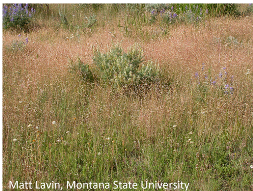
Matt Lavin, Montana State University

unpalatable once panicles appear, so grazing as a management option is limited to early spring. Herbicides labeled for control of ventenata in pasture, range and CRP are limited because ventenata is such a recent issue. Imazapic applied in the fall to semi-dormant perennial grass stands has been effective, particularly when ventenata comprised more than 25% of vegetative cover. Furthermore, imazapic applied in the fall followed by an application of nitrogen fertilizer in the spring and fall of the next year has shown promise as fertilizer can help perennial grasses recover from herbicide damage and be more competitive. A study in Washington found that a spring application of imazapic was more effective than a fall application.