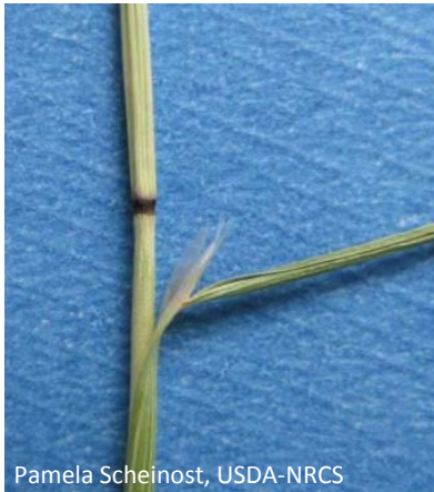
Pamela Scheinost, USDA-NRCS

Identification Ventenata is a winter annual grass native to southern Europe, western Asia and northern Africa. It is also known as wiregrass or North Africa grass. Ventenata is typically 6 to 27 inches tall with leaves that are rolled lengthways or folded. It has open sheaths, and the inflorescence is more or less lax, open, and pyramidal in shape (photo right). The color of ventenata has been described as tawny to light yellow. Grass identification can be difficult for many people, so look for these key characteristics on ventenata: reddish-black nodes in May-June (photo left); unusually long, membranous ligule (1-8mm) (photo left); distinct shiny appearance and open panicle in June-July; and lower awns that are straight and upper awns that are twisted and bent once the plant senesces in July-August (photo bottom right).